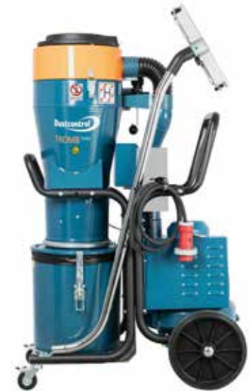
DC Tromb Turbo EX for ATEX zone 22