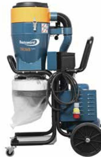
DC Tromb Turbo with VFD (Frequency Inverter)