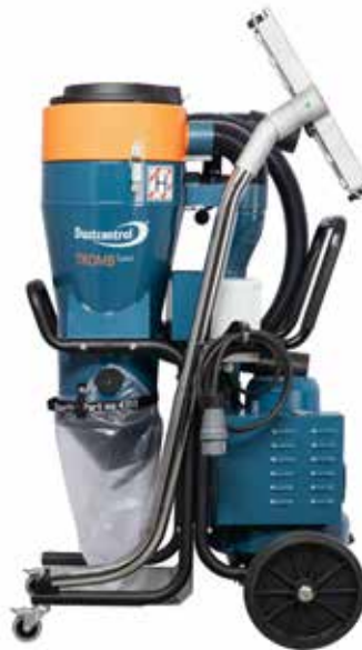
DC Tromb Turbo with Direct start